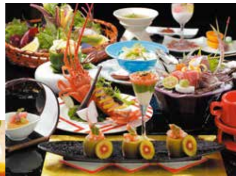
▲ an example of dinner menu