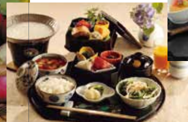
◀ an example of breakfast menu