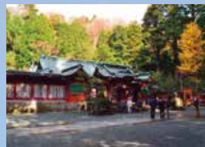
Shrine of Hakone is deity of marriage and economy