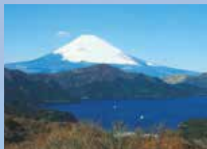
World heritage "Mount Fuji" from Lake of Ashino-ko