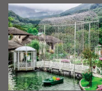
Venetian Glass Museum