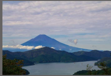
Mt. Fuji from Lake Ashino